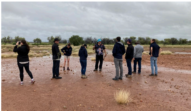
NBEWG delegates looking at cultural artefacts at Dharriwaa.