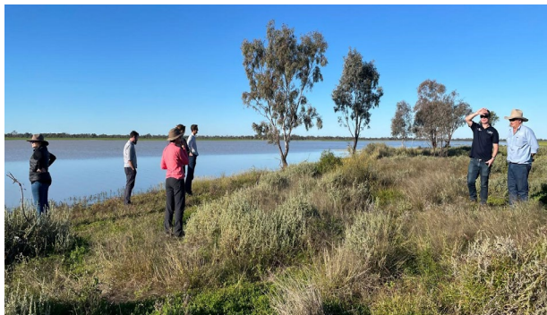
Commonwealth water agency staff engaging with stakeholders at Lake Bokhara, June 2022.