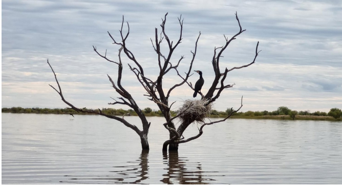
Great cormorant at Clear Lake, June 2022. Photo taken during scientific monitoring.

Colonial-nesting waterbirds bred at Dharriwaa this year for the first time in 10 years. Further, this is the first time in 24 years that breeding has occurred at the Macquarie Marshes , Gwydir wetlands and Narran Lakes concurrently.