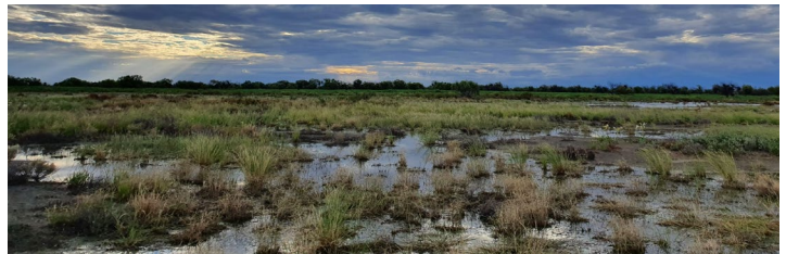
Dharriwaa, April 2022.