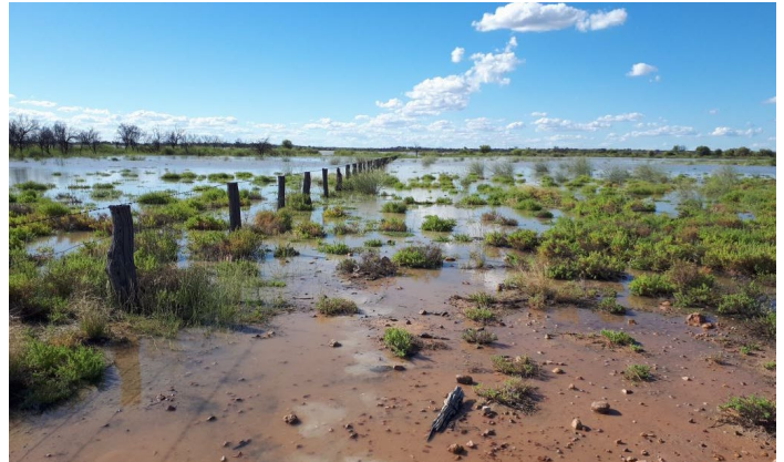
Clear Lake, April 2022.

Over 30 species of waterbirds were observed at Dharriwaa in 2021-22, including the threatened Freckled duck, White-bellied sea eagle and Black-necked stork.