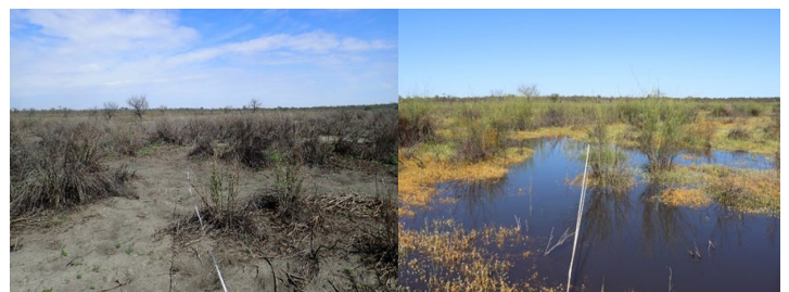
Vegetation monitoring at Narran Lakes showing an improvement in condition from March 2020 to December 2021.

All key waterbird breeding habitat was inundated (around 6,000 hectares of the Narran Lake Nature Reserve Ramsar site). Vegetation monitoring at Dharriwaa found plants are responding well to the wetter conditions and water for the environment. However, the areas hardest hit during the extreme dry are still recovering and good flows over the next couple of years will be critical to their ongoing recovery.