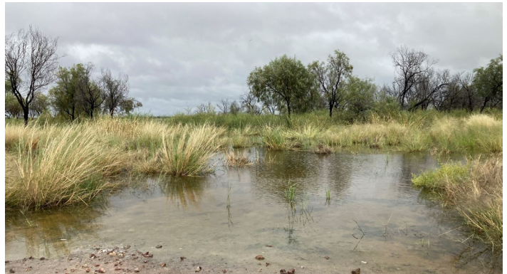
Dharriwaa, April 2022.

The Commonwealth Environmental Water Office (CEWO) prepared a grant program to deliver water from a private storage on the Narran River to help keep water levels stable so waterbirds could complete their breeding. Nature did the job for us this time without needing to implement the grant, but this preparation has set us up well for the future.