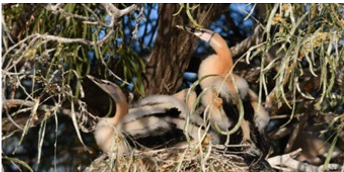
Australasian darter chicks at Narran Lakes, April 2022. Photo taken during scientific monitoring.

Over 10,000 Straw-necked ibis' nests were recorded as well as Spoonbills, Egrets, Cormorants and Darters. Monitoring identified a nest success of 86%.