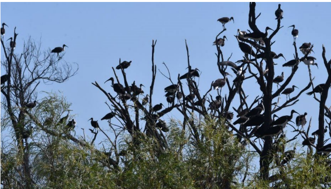
Juvenile straw-necked ibis at Narran Lake, April 2022. Photo taken during scientific monitoring.

Over 10,000 Straw-necked ibis' nests were recorded as well as Spoonbills, Egrets, Cormorants and Darters. Monitoring identified a nest success of 86%.