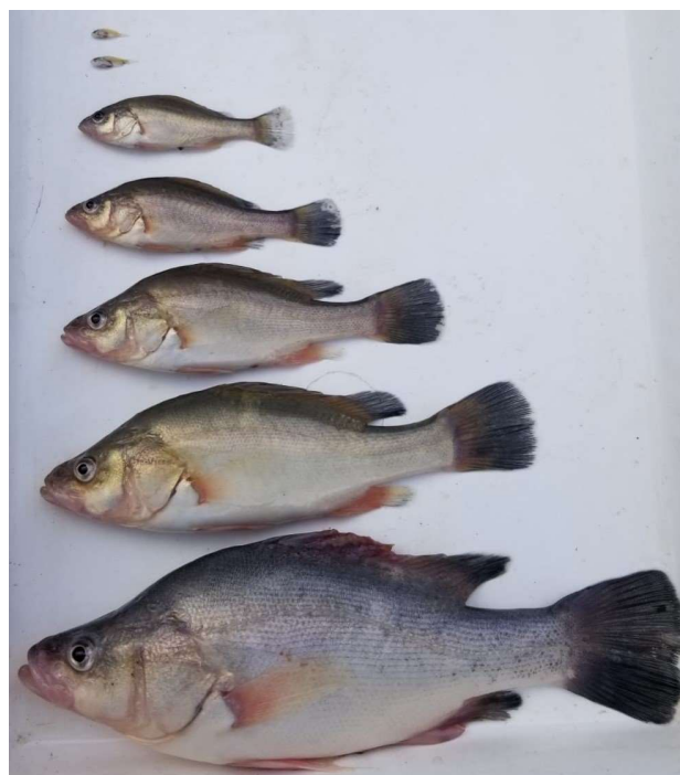
A range of golden perch size classes were caught during recent monitoring across the Lower Balonne demonstrating that golden perch have spawned and recruited in response to flows over the past 12 months

Queensland department staff have been monitoring native fish across the Lower Balonne during these flows. Fish sampling in spring last year and autumn this year found that golden perch had successfully spawned and recruited across the catchment over the past two years.