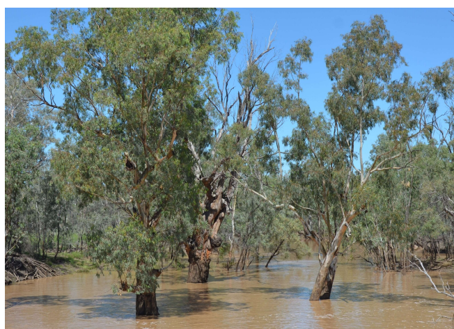
Narran River downstream of the Clyde Weir flowing at around 1,076 ML/d on 30 March 2021

More than 330 gigalitres (GL) has flowed passed the St George gauge since January 2021. This inflow is important, but relatively small: only one-third of the historical annual average and less than a quarter of the 1,442 GL that passed St George in early 2020. Commonwealth water for the environment contributed around 43 GL across the Queensland Lower Balonne rivers during March and April 2021. Over 36 GL of this water passed the New South Wales border, contributing to flows downstream in the Darling River. The Commonwealth portfolio also contributed around 3 GL from the Nebine Creek. This water will help build on the environmental benefits achieved from last year's flow event .