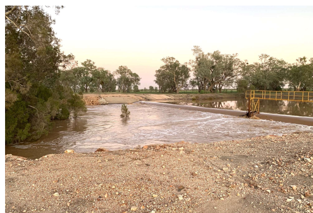
A business case will be developed for a fishway at the Cubbie Weir along the Culgoa River as part of the Northern Basin Toolkit

The Australian Government is funding several projects to enhance the benefits of water for the environment across the Lower Balonne. These projects form part of the Northern Basin Toolkit .