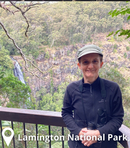
📍 Lamington National Park