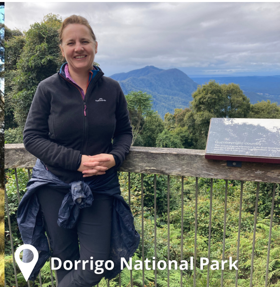
📍 Dorrigo National Park