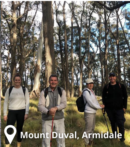
📍 Mount Duval, Armidale