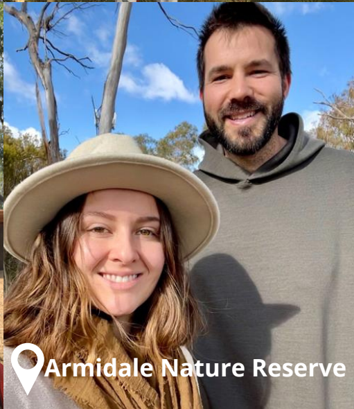
📍 Armidale Nature Reserve