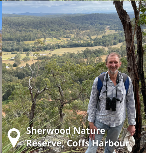
📍 Sherwood Nature Reserve, Coffs Harbour