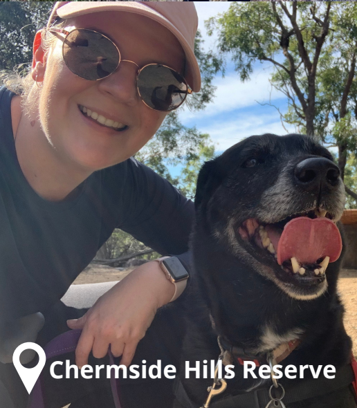
📍 Chermside Hills Reserve