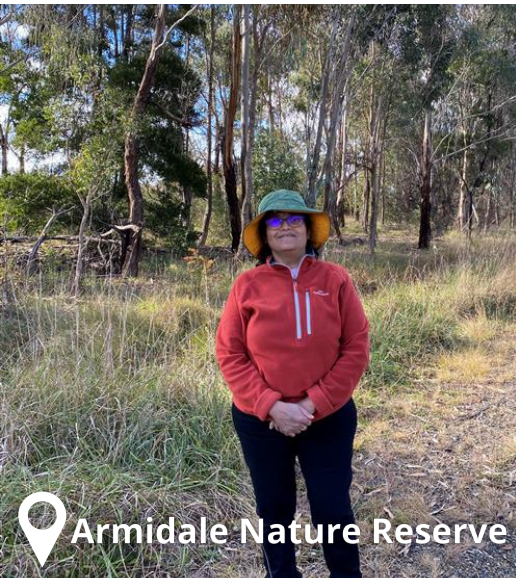
📍 Armidale Nature Reserve