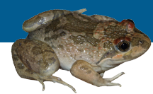
Figure 1: Barking Marsh Frog ( Limnodynastes fletcheri ).