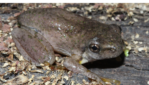
Figure 5: Peron's Tree Frog ( Litoria peronii ) in the Gwydir wetlands.

Managing water for the environment is a collective and collaborative effort, working in partnership with communities, private landholders, scientists and government agencies - these contributions are gratefully acknowledged.