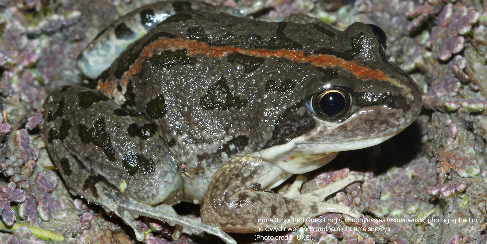
Figure 3: Spotted Grass Frog ( Limnodynastes tasmaniensis ) photographed in the Gwydir wetlands during night-time surveys.

Not all Yurraya species have the same biotic and abiotic preferences - some like the Knife-footed Frog, a burrowing species, likes to be in the floodplain areas or alongside riverbanks. Other species such as the Barking Marsh Frog exhibit strong associations with tall spike-rush ( Eleocharis sphacelate ). These niche environments are known as microhabitats and many Yurraya species within the Gwydir Wetlands rely on these specific conditions and resources for breeding and foraging (Figure 4).