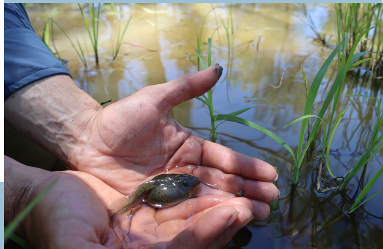
Figure 4: Water-holding Frog ( Cyclorana platycephala ) tadpole found within the Gwydir wetlands.

Biotic factors are the living things such as the plants, animals and bacteria, while abiotic factors are the non-living components in our ecosystems such as water, soil, atmosphere and temperature.